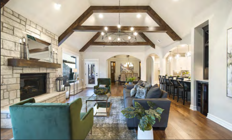
Open concept one-story homes; Dynamic ceilings

Our standard features are upgrades to most builders.