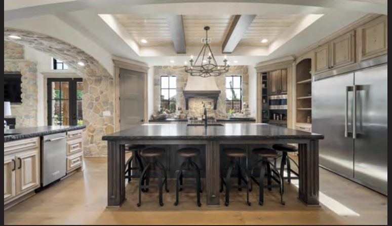
Extensive trim package; Upgraded appliances